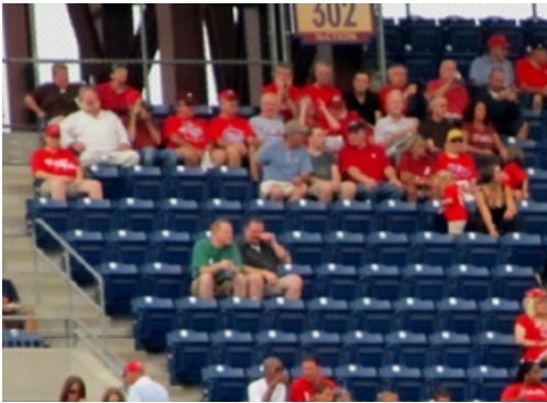
Shot from across the stadium