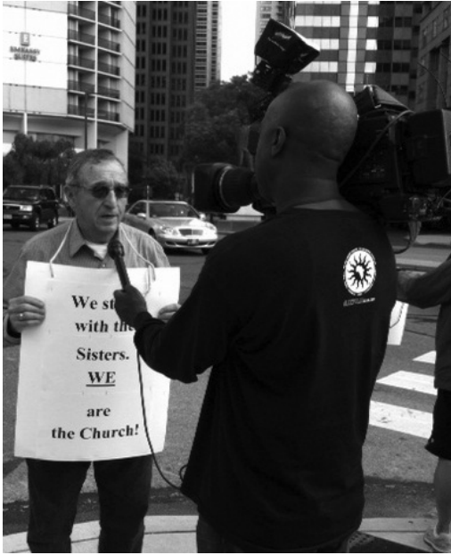
Dick speaking to the press; picture appeared in The Inquirer 5/23/12.