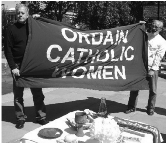
Members of the Women's Ordination Conference prior to the Liturgy held at the park.