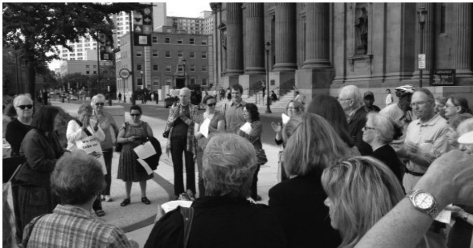
Participants at the Nun Justice Rally 5/22/12