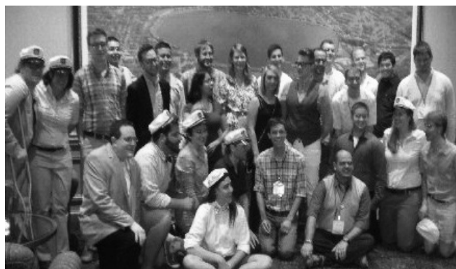
The Young Adult Caucus at the Dignity convention; this is the next generation of LGBT Dignity members.