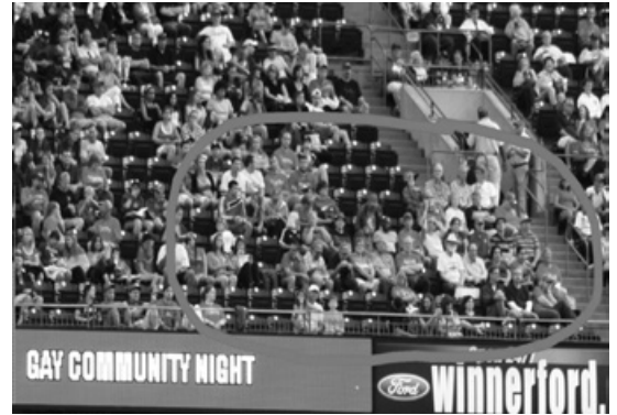
Proof that we were at the game – Gay Community Night