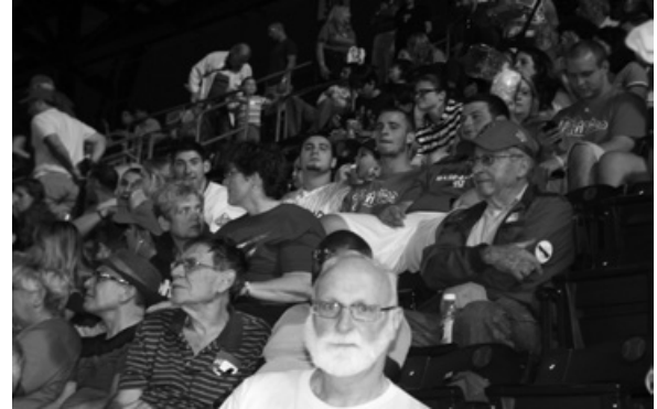
Can you spot the Dignity members?