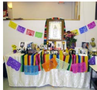
The finished altar – great work!